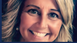
From the President: What's Ahead for SAC