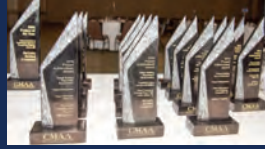
Project Achievement Awards : 2017 Winners